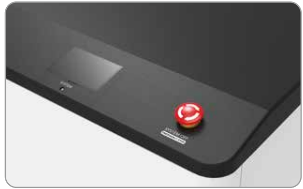
Top-Side Control Panel

The ION MATE series are All-in-One Energy Storage Systems that integrate high-quality, long-life Lithium Iron-Phosphate Batteries, Battery Management Systems (BMS), AC Chargers, Photovoltaic (PV) Chargers, DC- AC inverters and System Control, with wireless monitoring, into a self-contained, self-managed unit to effectively utilize solar energies and AC grid power while providing back-up capability.