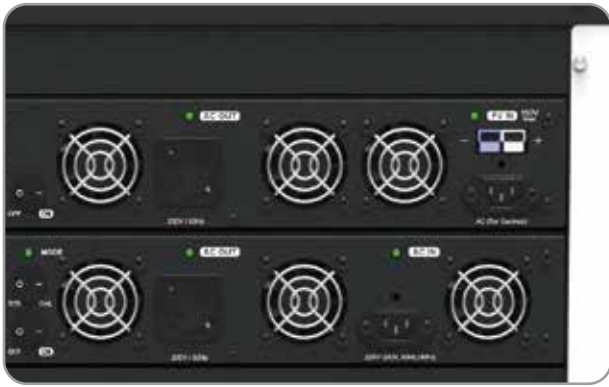
Rear Cable Connection Panel