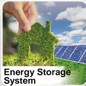
Energy Storage System